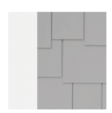
Clambake Siding with Cumulus White Trim