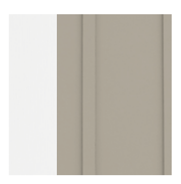
Napatree Dunes Siding with Cumulus White Trim