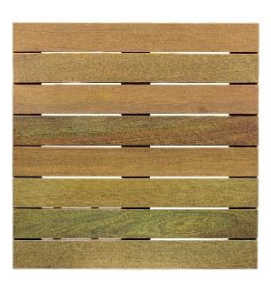
TFP BLACK LABEL™ PREMIUM SELECT- Architectural Grade ... Selected for Premium Appearance on 4 Sides and 4 Edges.